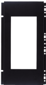
PLATE SIAMENS OP17 5H4L